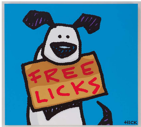
Ed Heck, "Free Licks" 2013 ,36" X 36" Acrylic on Canvas