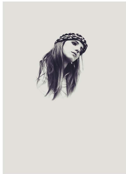
Andreina Restrepo, The Ghost Inside , 2010, 16.5 x 11.7 inches. Digital Photomanipulation.