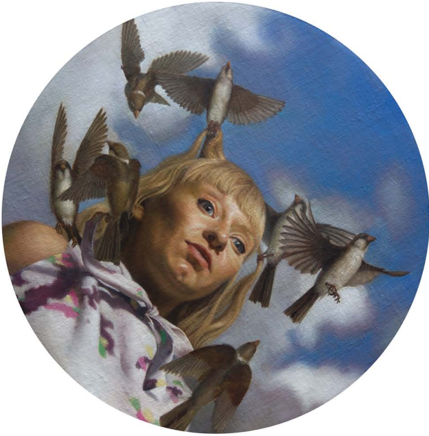
Zane York, Untitled, 2013, 16" (diameter), Oil on Linen mounted on Panel.