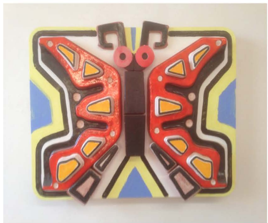
Steve Keister, ButterflyI, 2013, 24 1/2 x 32 x 6 1/2", glazed ceramic, acrylic/wood.