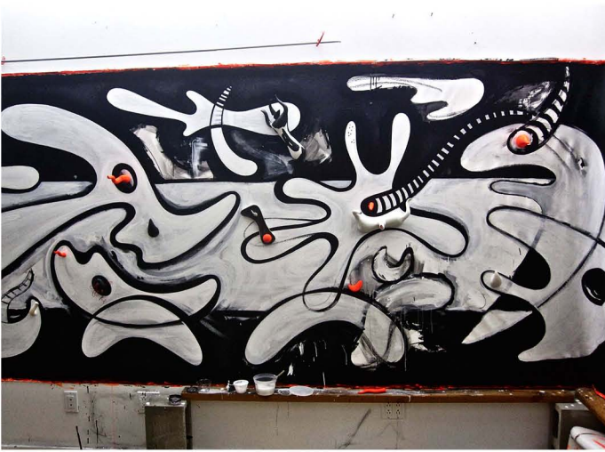
Sylvia Nagy, Objects in Dialog , 2013, 72'x 195'x 8', Slip-casted porcelain on acrylic painting on canvas.