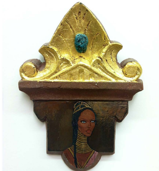
Edwin Vera, "Naomi" , 2011, 6"x9", glazed red stoneware with