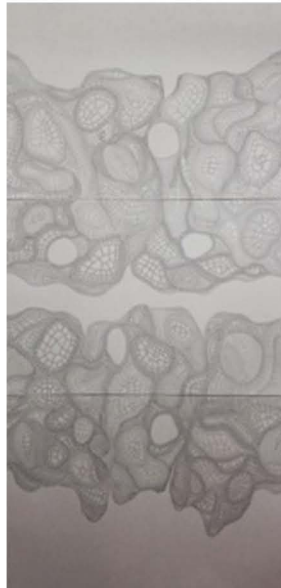
Nicholas Constantakis, Unfurl, 2013, 90" X 44", Ink on Paper