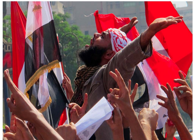
Constantine Markides, Tahrir , 11 x 14, Photo on Canvas