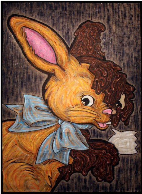
Paul O'Connor, ARTIFICIALLY FLAVORED / HOLLOW INTERIOR , 2013, 54"x78", Mixed Media on Burlap