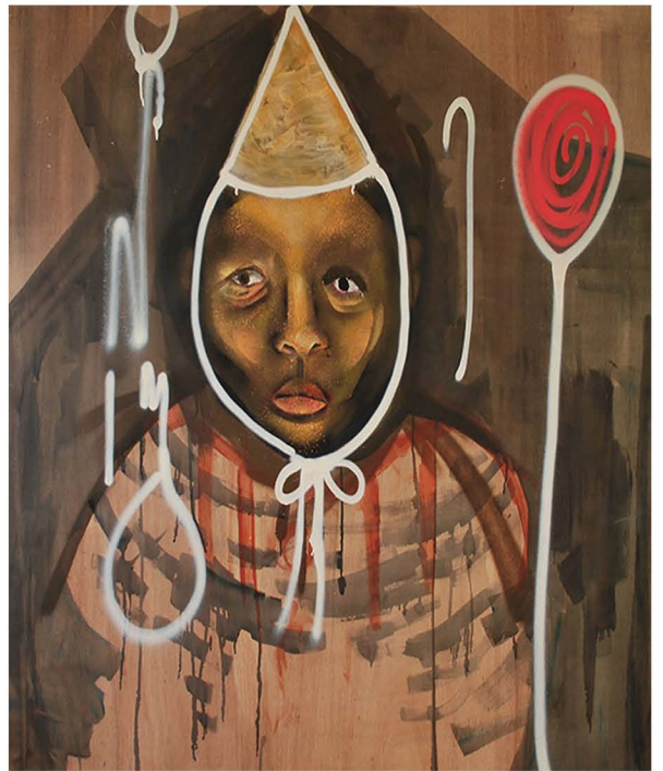
JunJun Zhang, Folk I, 2012, 4' x 4', Mixed Media on Wood