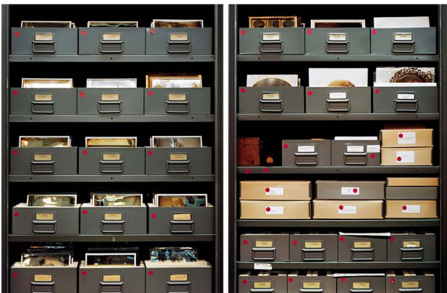
Luis Mallo, Open Secrets (GEH Daguerreotype Cabinets, Diptych) , 2009, 29"x76", Chromogenic Prints mounted on aluminum with plexiglass face mount.