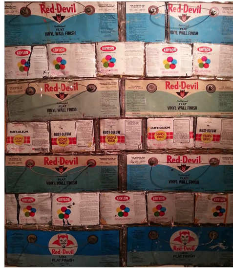
Francis Mark, "sprinter"(detail photo)', 2013, 36"X 8" steel wire and used spray cans