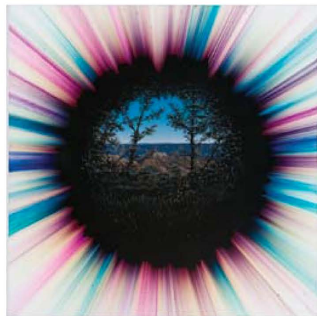
Shane McAdams, Synthetic Landscape 53 (North Rim) , 2011, 24"X24", Ball Point Pen, Oil & Resin.